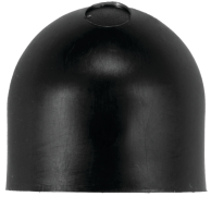
6LV1352 Light Shield Accessory for EK4036S, EK4436SM, K4000 Series Button Photocontrols